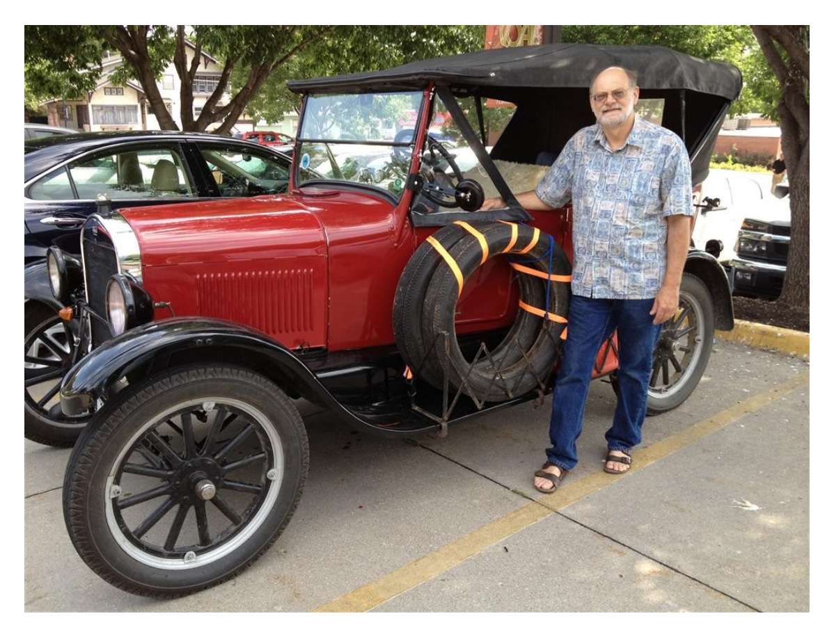
The car is all packed up. In the church parking lot.

The first day out was a good one! I had the Model T all packed up last night ready to head out in the morning. I hopped in the T and headed to Lincoln at about 9:20 a.m. for church. It was a nice service that included five baptisms.