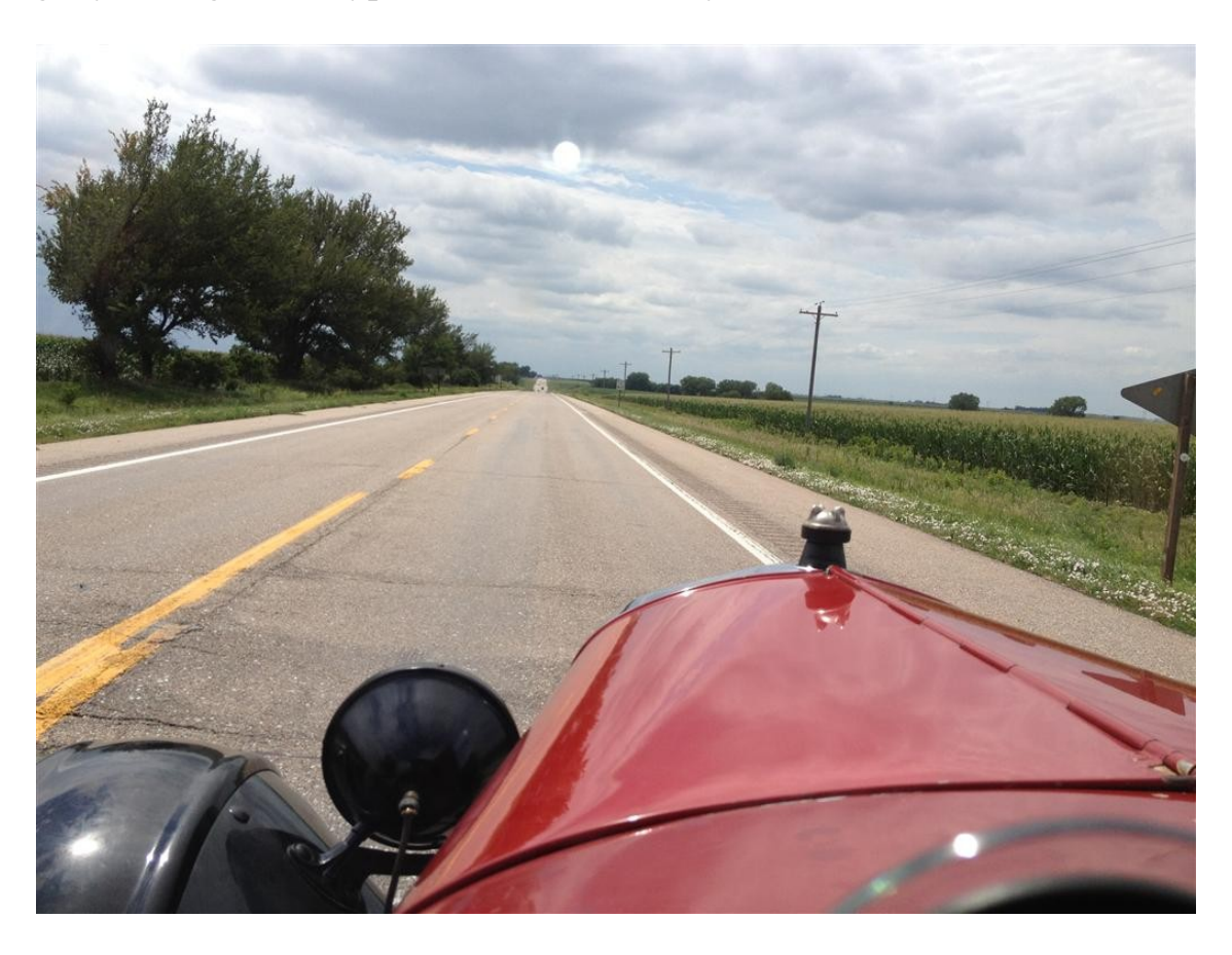
Typical scenery for the day.

The scenery would have been boring for many, but it is what I grew up with so it is pretty and soothing to me. Mostly corn fields with some soy beans. The terrain is flat or just slightly rolling hills. Typical Nebraska countryside.